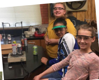
Fun LAB day with the 8th

MRS. LIND'S class ending the day with KIND WORDS!