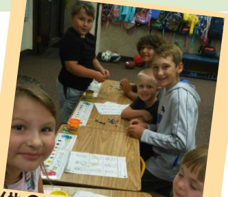
6th Grade & Kindergarten buddies reading