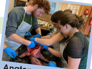
Anatomy great opportunity to perform a necropsy on a premature calf.