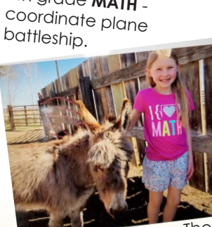
Distance Learning... There is MATH all over the farm!