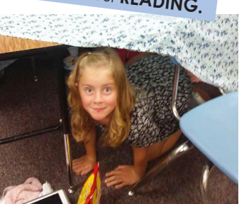
BUILDING FORTS in 4th grade