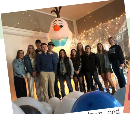
We are ready to get down and boogy!!! Winter Wonderland MORP January 2020!